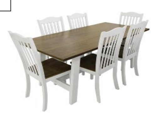
Dining Table Set with 6 Chairs (1 set)