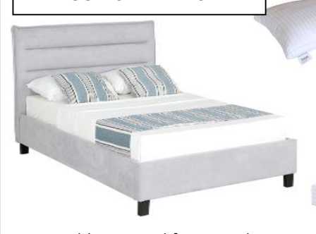
Double size Bed frame with Headboard (1 piece)